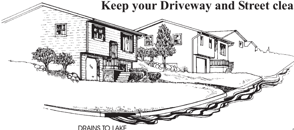
DRAINS TO LAKE